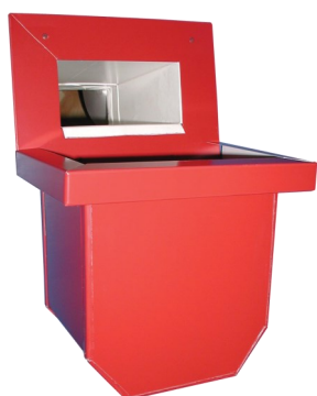
Shown with metal flange scupper